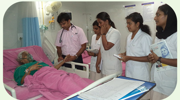
Ward Round Participation