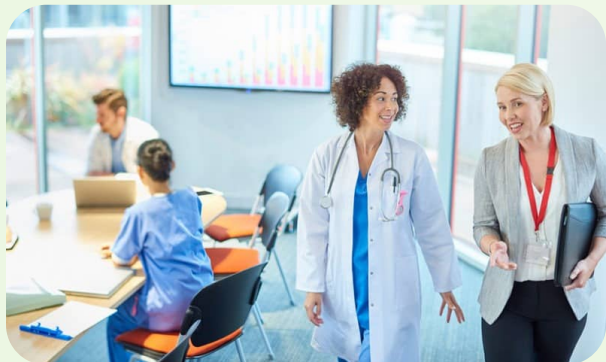
Sales & Marketing