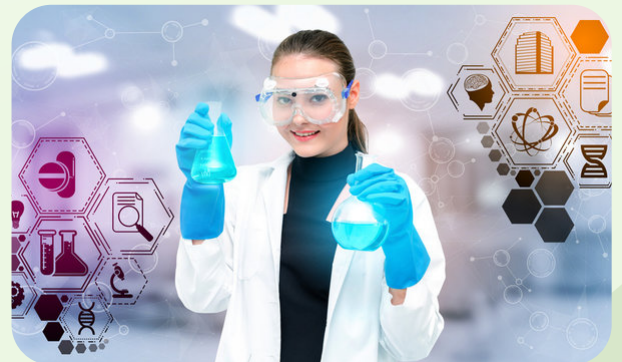
Research & Development