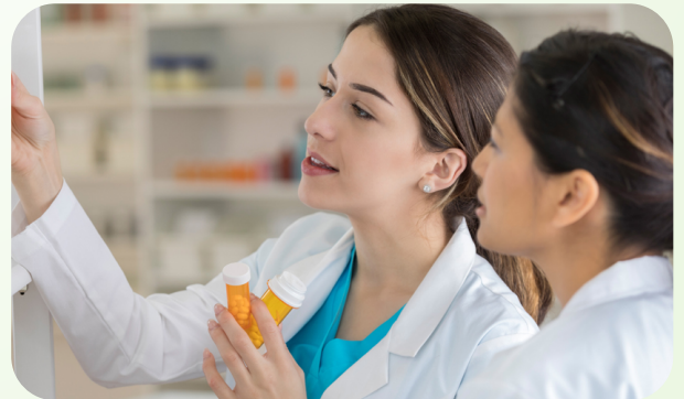
Hospital & Clinical Pharmacy