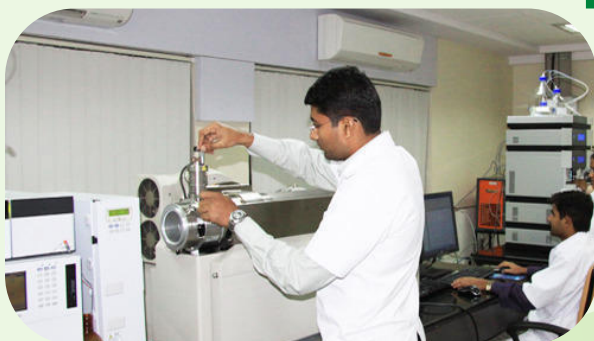
Bio Analytical Research