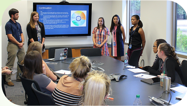
Drug Information center