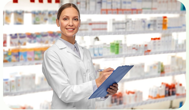
Dispensing & Retail